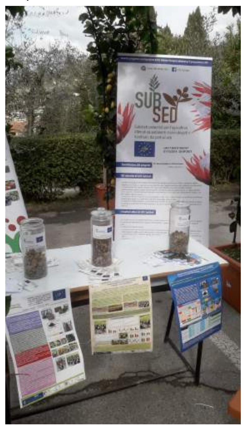
2.15 Naturalitas exhibition. Technical agronomical institute "D. Anzillotti" of Pescia (Italy), 13-14 April 2019 - CREA-OF