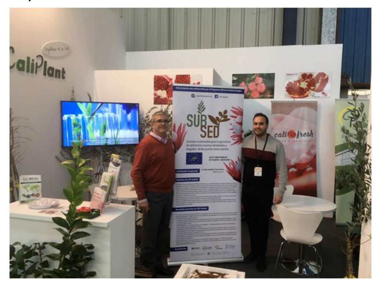
2.10 Agroexpo fair (XXXI edition). Don Benito (Estremadura – Spain), 23-26 January 2019 – CALIPLANT